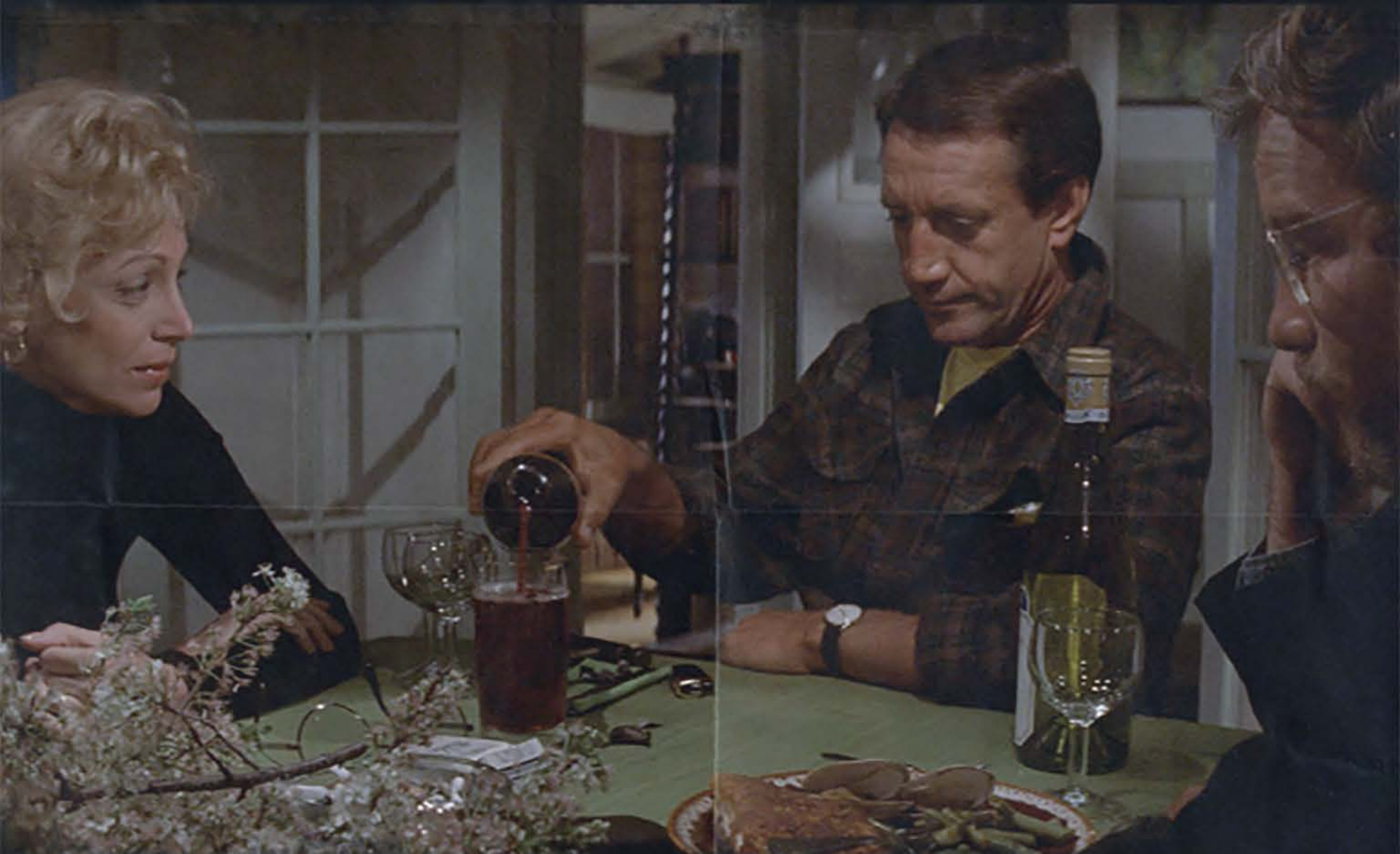
JAWS DIRECTOR STEVEN SPIELBERG