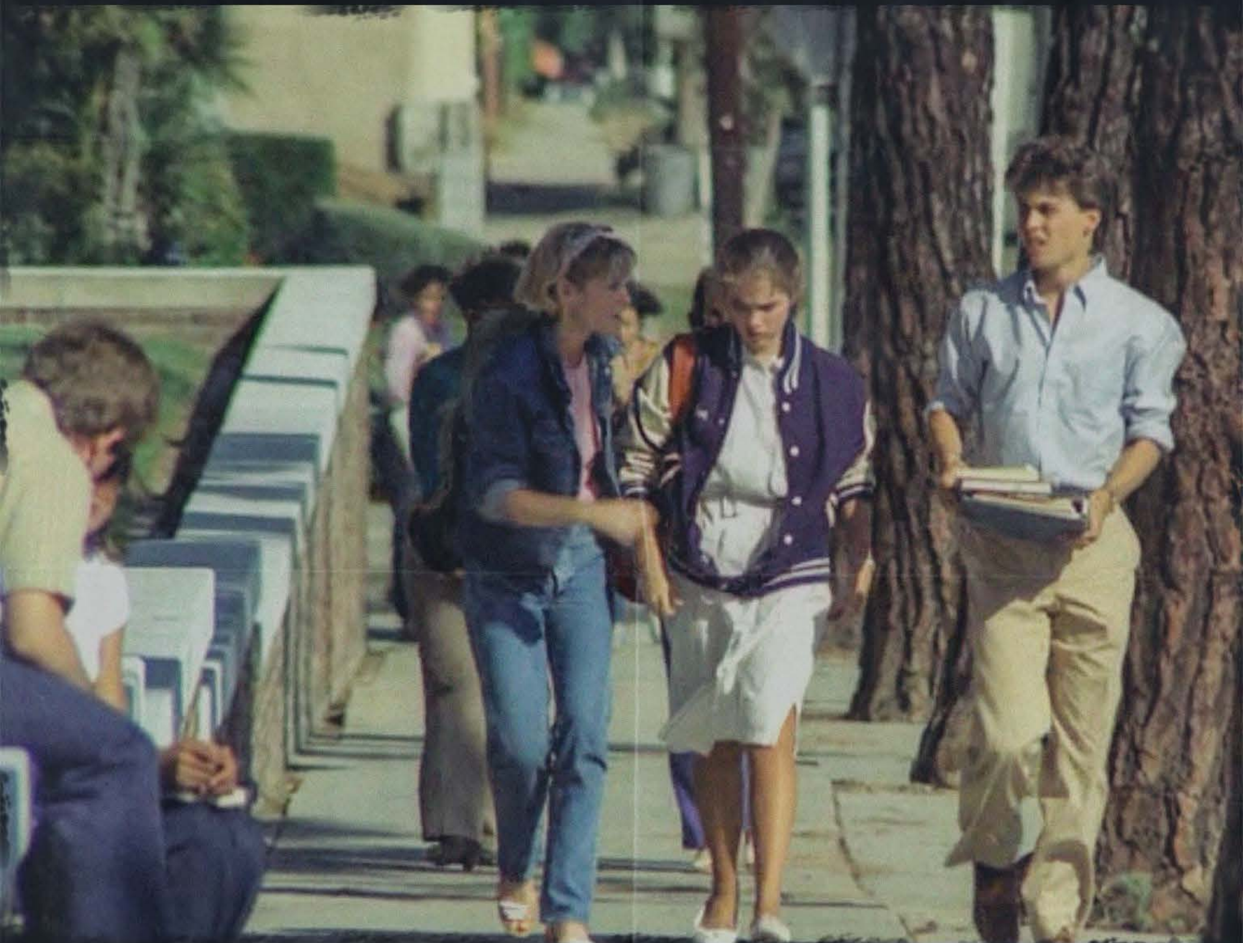
A NIGHTMARE ON ELM STREET DIRECTOR WES CRAVEN