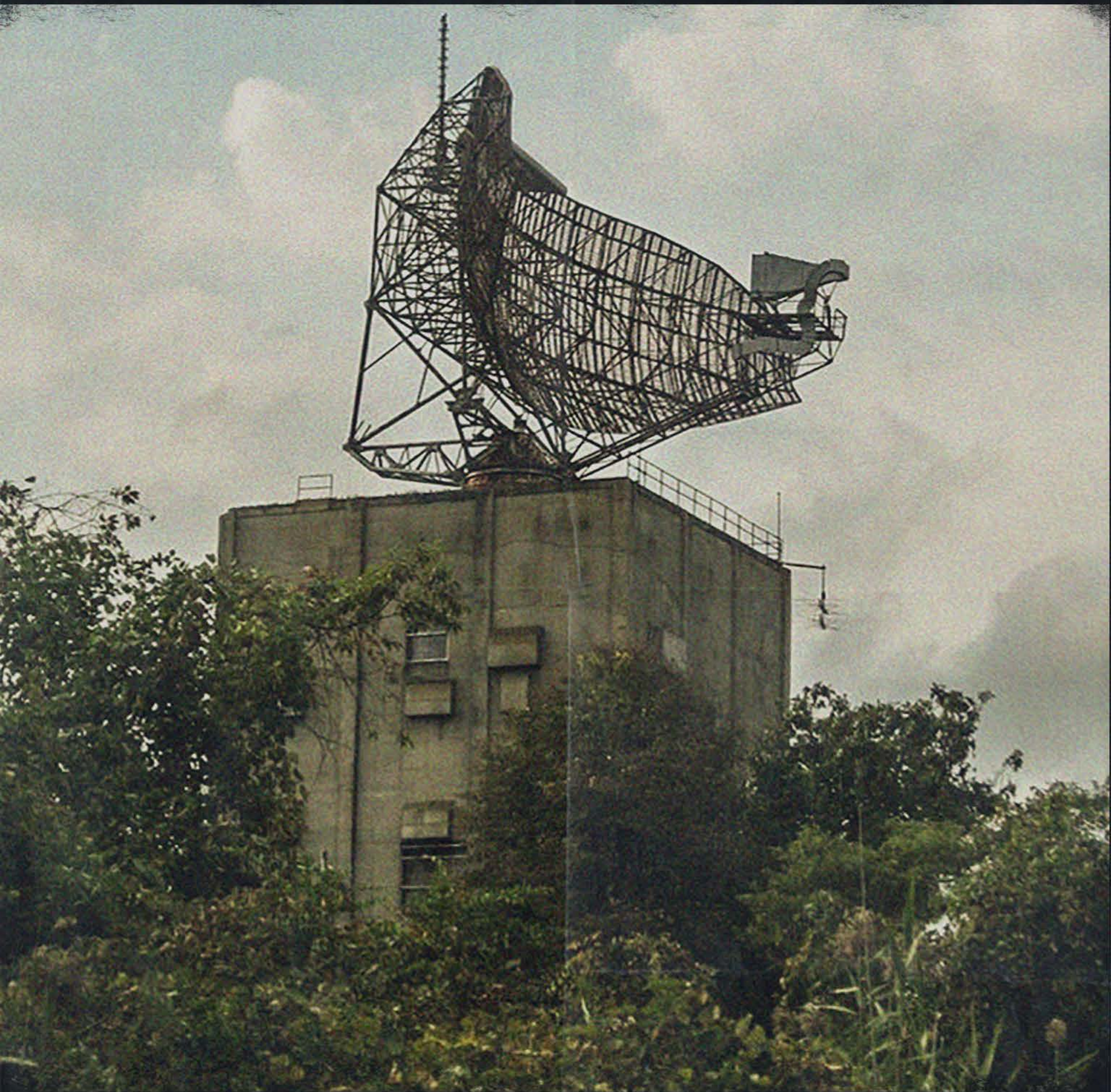
CAMP HERO AIR FORCE BASE MONTAUK, LONG ISLAND CIRCA 1980